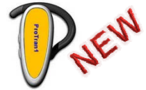
Safety Yellow Vibrating Audible Blue Tooth