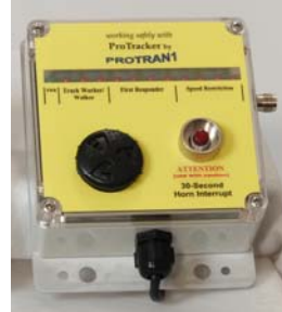
Train Device (TD) Placed in operators cab