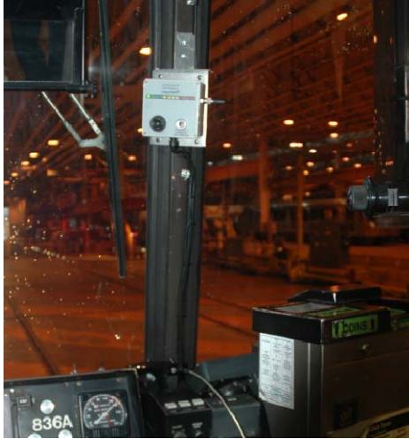
TD mounted in an operators cab.