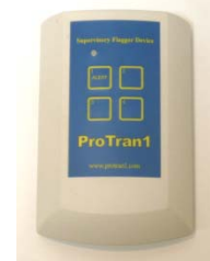
Flagger Device (FD) Wireless Flagger Alarm