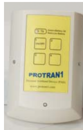
Personal Alert Device (PAD) Worn by track personnel