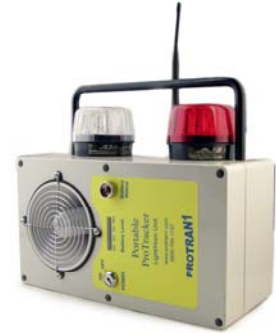
Portable Warning Horn/Light (PWLH) Placed in work zone